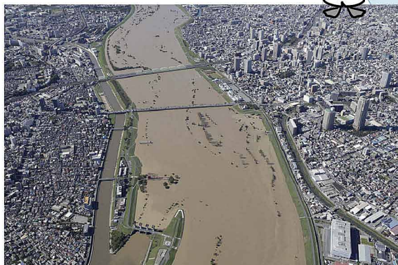
Arakawa River After Typhoon Hagibis (Typhoon 19 of 2019) passed through (Near Kita City, Iwabuchi Floodgate on October 13 around 1PM Approx. A.P.+7.01m (Approx. 70 cm lower than the flood danger water level))