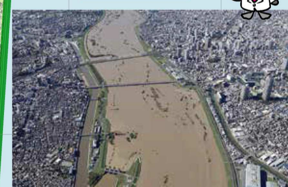
Arakawa River After Typhoon Hagibis (Typhoon 19 of 2019) passed through (Near Kita City, Iwabuchi Floodgate on October 13 around 1PM Approx. A.P.+7.01m (Approx. 70 cm lower than the flood danger water level))

During Typhoon Hagibis (Typhoon 19) in 2019, water reached flooding risk levels, and conditions were very dangerous.